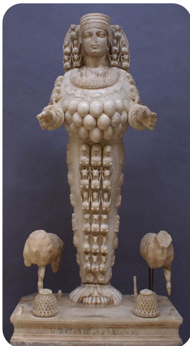
Goddess Artemis of The Ephesians

23 About that time there arose a great disturbance about the Way. 24 A silversmith named Demetrius, who made silver shrines of Artemis, brought in a lot of business for the craftsmen there. 25 He called them together, along with the workers in related trades, and said: “You know, my friends, that we receive a good income from this business. 26 And you see and hear how this fellow Paul has convinced and led astray large numbers of people here in Ephesus and in practically the whole province of Asia. He says that gods made by human hands are no gods at all. 27 There is danger not only that our trade will lose its good name, but also that the temple of the great goddess Artemis will be discredited; and the goddess herself, who is worshiped throughout the province of Asia and the world, will be robbed of her divine majesty.”